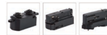
2 Wires Single-circuit 3 Wires Single-circuit 4 Wires 3 circuits