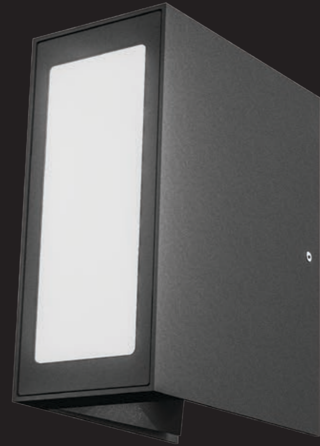
ERI Wall Light